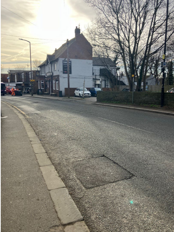
Car park on Church Street is next to the Robinhood Pub.