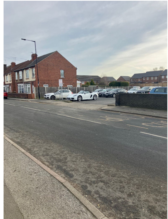
Car park entrance off Queen Street.