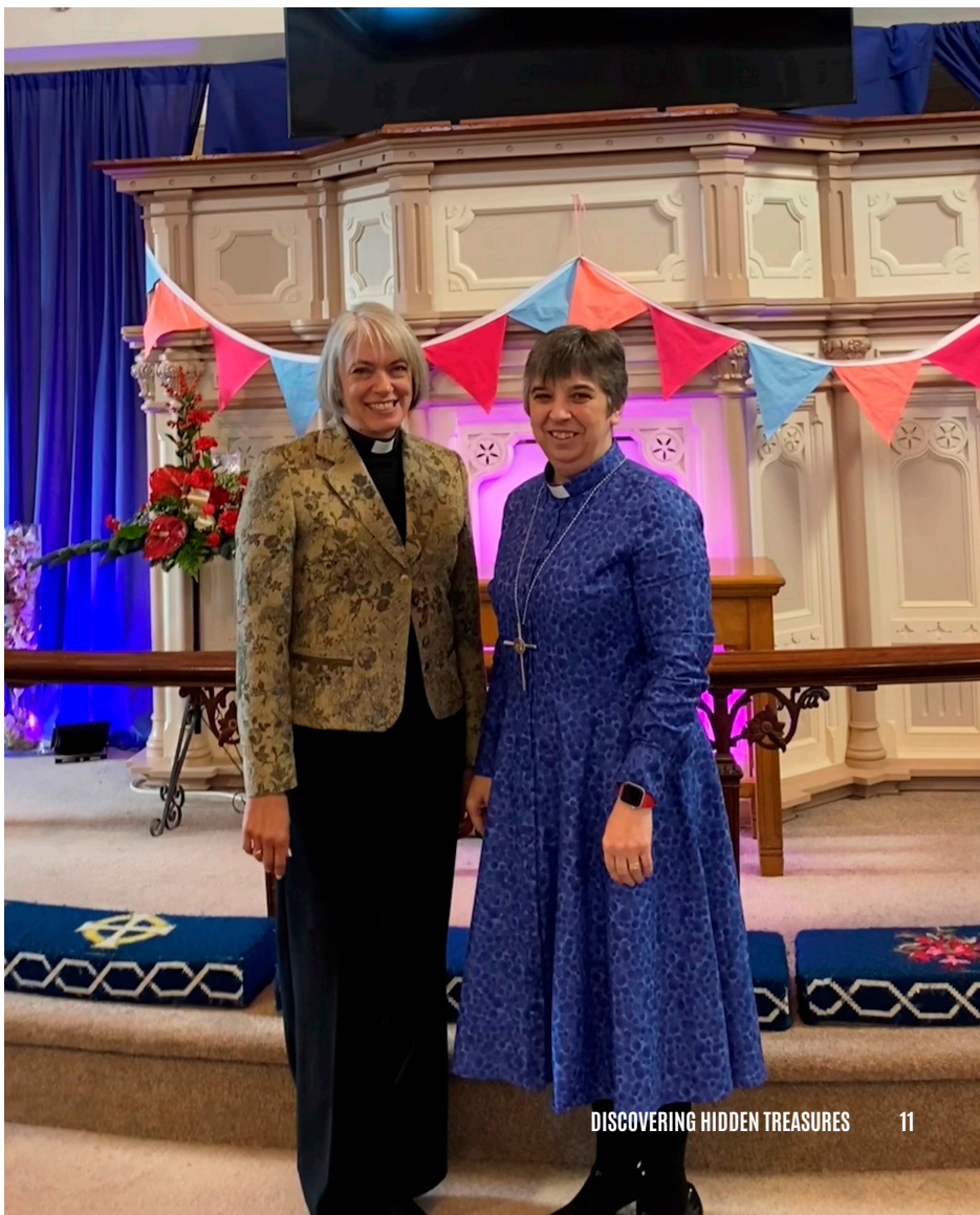
DISCOVERING HIDDEN TREASURES 11

So, the evidence suggests that despite the challenges we face, God is still active amongst us. Treasure is still being discovered by us! We are growing, we are becoming more inclusive, we are being evangelistic, and we are justice-seeking!”