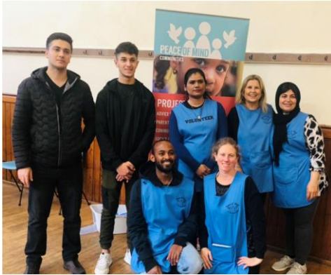
Some of the volunteers at Peace of Mind.

It is reported** that the North East has the biggest percentage of asylum-seekers awaiting decisions about their future in the whole country (double the number in London). Among the organisations responding to the needs of these people is Peace of Mind, which since 2014 has been supporting refugees and asylum seekers (RAS), both individuals and families in the Gateshead and Newcastle area, to overcome some of the cultural, language and social difficulties and barriers they face and help them to integrate into life in the UK. They provide advice, translation services, education, emergency food packs and household and personal care items.